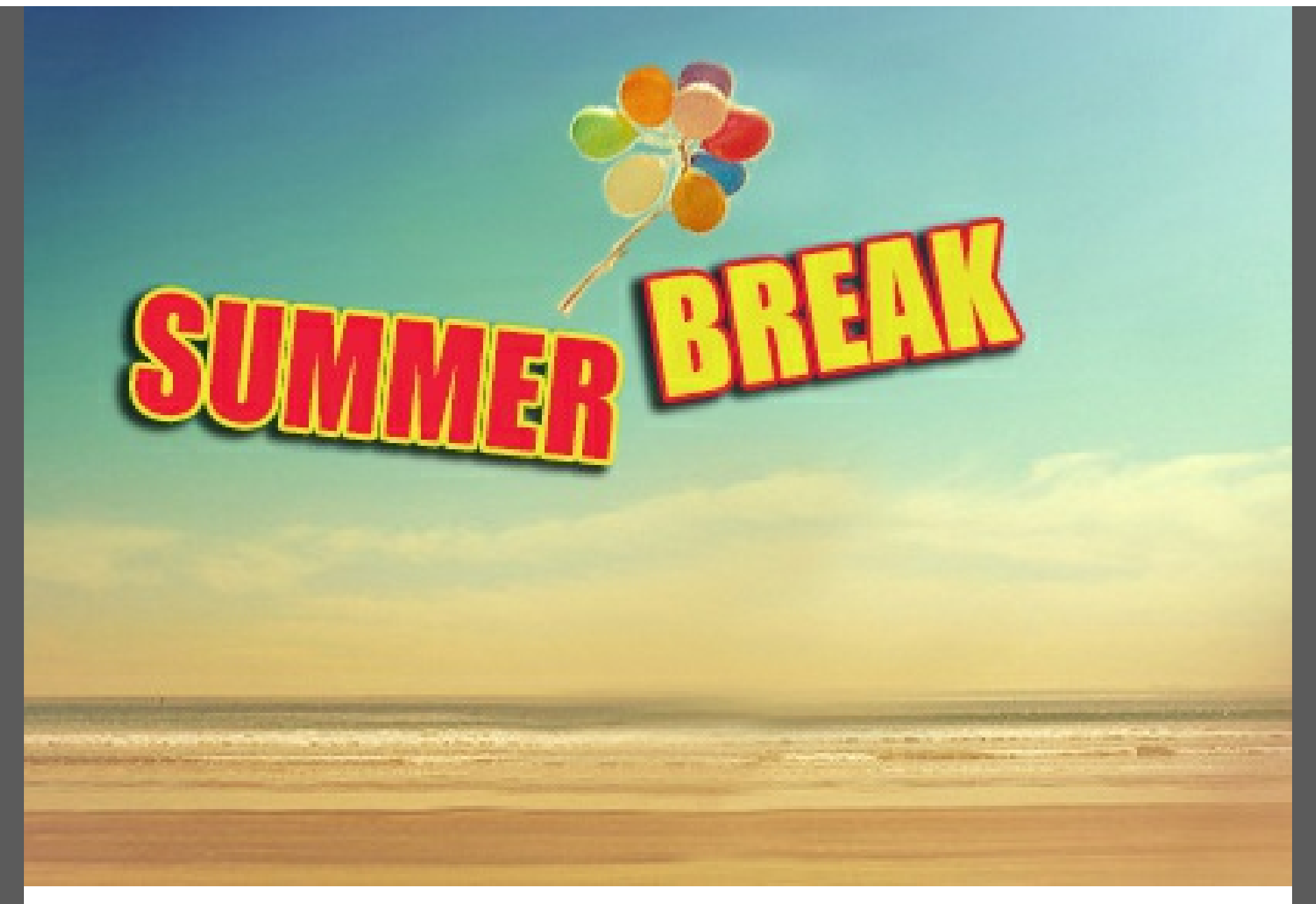
Summer Hiatus - Next Seminar

It's time for our summer break from seminars! There will be no seminar in July or August (but we will have webinars). Our next seminar will be Saturday, September 8, 2018. The seminar title is "I Am Not A Crook" and it will be from 10:00 a.m.-12 Noon.